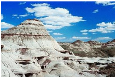
IMAGE SOURCE PAGE: http://www.travelinalberta.com/southern-alberta.cfm

In this region, many people live in cities, towns and villages. Some people live on farms and ranches.